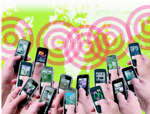
Award to amateur video shows industry evolution.