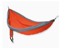
Eagles Nest Outfitters Double Nest Hammock