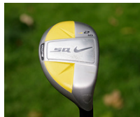
Roundup: Hybrid Golf Clubs