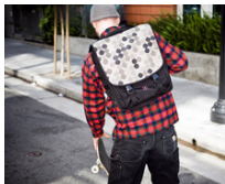
Roundup: High Tech, Eco Friendly Backpacks