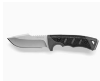
Gerber Metolius Fixed Blade